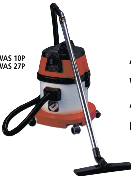
WAS 10P WAS 27P